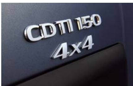
The Oberaigner 4x4 conversion is available with a variety of power outputs of the Movano 2.3CDTI 16v diesel engine.