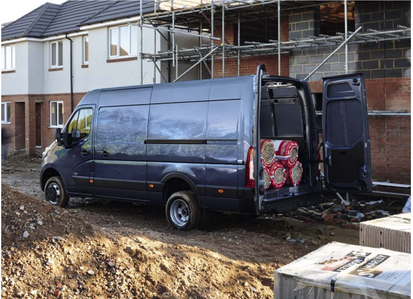
The specifically designed, lightweight AWD components ensure that the Movano maintains its load carrying potential. L3 H2 R3500 HD panel van model illustrated.

Servicing requirements are exactly the same as standard Movano models and can be carried out through the Vauxhall Commercial Vehicle retail network. Direct technical support can also be provided by Oberaigner if required and the conversion itself is supported by a separate two-year/75,000 mile warranty.