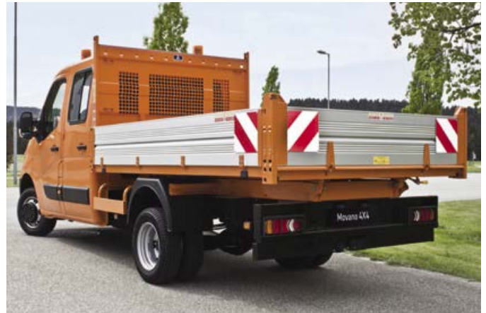
The conversion also extends to RWD Movano chassis and crew cabs including the tipper and dropside core conversions. L3 H1 R4500 HD crew cab tipper model illustrated.

The Oberaigner 4X4 conversion is offered on all RWD L3 and L4 variants for panel van, doublecab, chassis or crew cab models, plus all RWD L2 H1 chassis or crew cab models. Both 3500 and 4500 GVW ratings are available. The conversion can also be specified for the respective tipper and dropside core conversions.