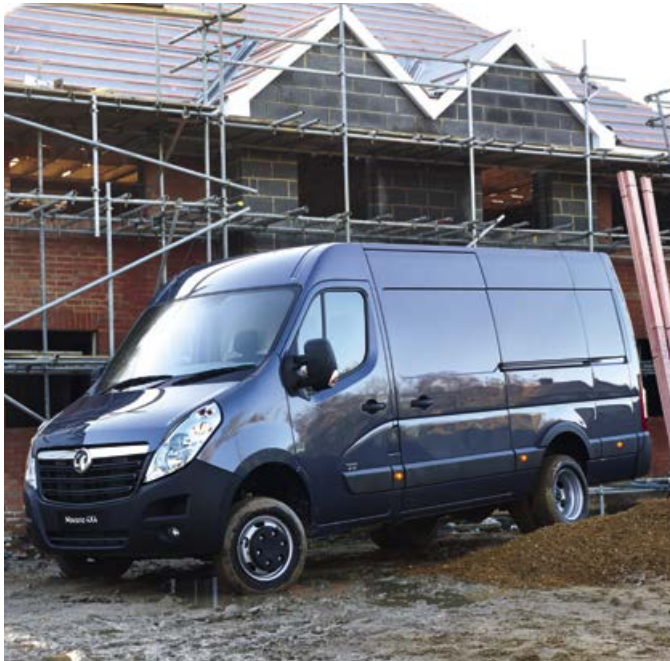
The Oberaigner conversion can be carried out on all RWD Movano panel vans. L3 H2 R3500 HD model illustrated.

The Oberaigner 4X4 conversion is offered on all RWD L3 and L4 variants for panel van, doublecab, chassis or crew cab models, plus all RWD L2 H1 chassis or crew cab models. Both 3500 and 4500 GVW ratings are available. The conversion can also be specified for the respective tipper and dropside core conversions.