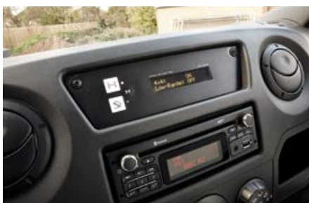
The operation of the AWD system is controlled via a fascia button and fascia display that ensures it's simple to switch between RWD and AWD as driving conditions demand. In AWD mode the ESP and ABS systems are disconnected. Operation of the ignition switch restores the ESP and ABS once the AWD system is de-activated.