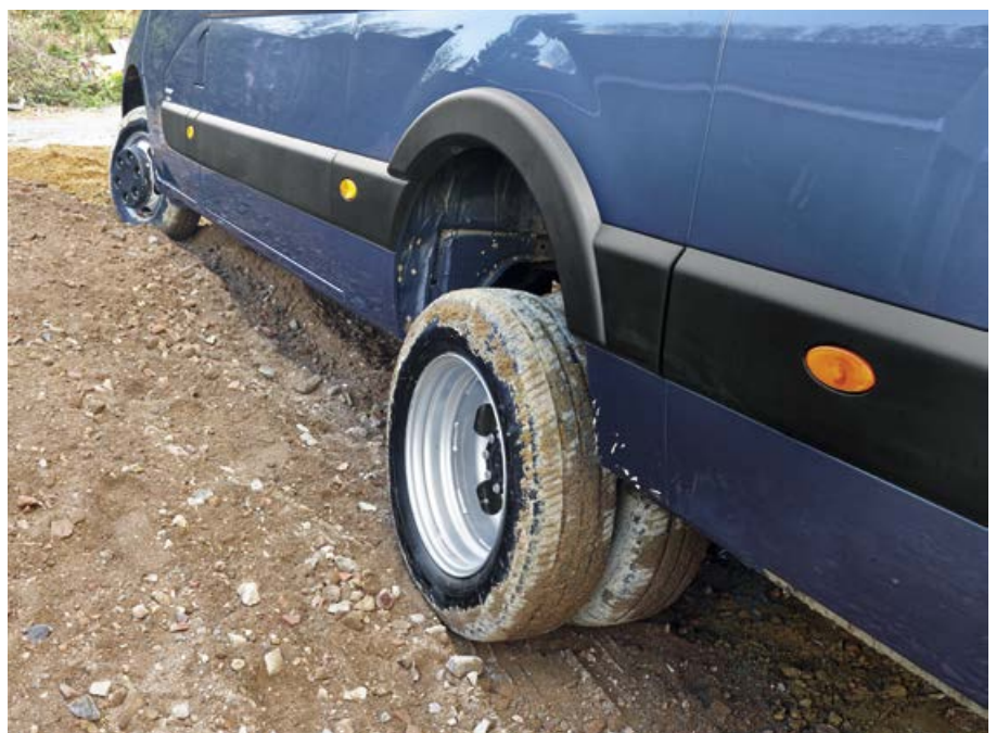
As well as the standard AWD driving mode there is also a low-range mode when more difficult driving conditions prevail such as pulling away under load in tricky off-road conditions. Although the AWD system can also be deployed when driving on harsh road conditions, long term on-road driving with the AWD system engaged is not recommended due to the standard fitment of the lengthwise locking rear differential, transfer case and front axle.