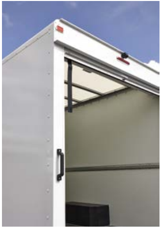
Rear access grab handle.