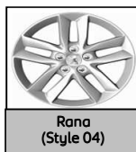
Rana (Style 04)