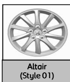
Altair (Style 01)