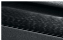
Echo Allure / GT