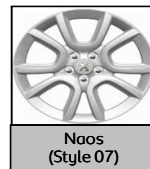
Naos (Style 07)