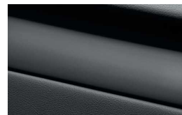
Matt black Access