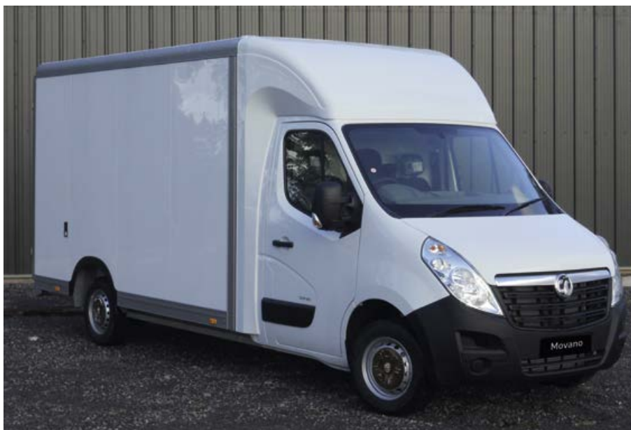
L3 H1 platform cab, standard roof, low floor Luton body.

Standard features include: Double rear doors opening to 270 degrees (other options available); anti-slip plywood flooring, opalescent fibreglass roof for improved internal visibility; interior lamps; strong steel bulkhead giving cab security and high level brake lights. All this can be driven with a standard category B licence, and with no need for an 'Operators Licence'. The standard roof, low floored Luton van has loadspace volume of 18.5cu.m (653cu.ft.) and payloads up to 1310kg.