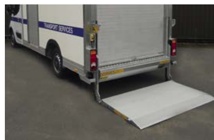
Tail lift optional at extra cost.