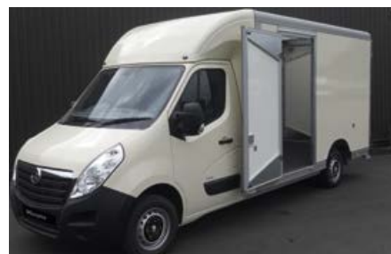
Side-access doors optional at extra cost.