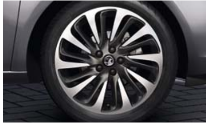
18-inch 10-spoke alloy wheels with 225/40 R 18 tyres.