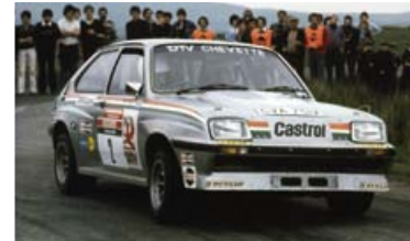
1971 – The formation of Dealer Team Vauxhall (DTV). The track car was the precursor to our enormous success in touring car racing.