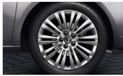
16-inch twin-spoke alloy wheels with 205/55 R 16 tyres.