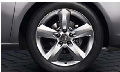
17-inch 5-spoke alloy wheels with 225/45 R 17 tyres.