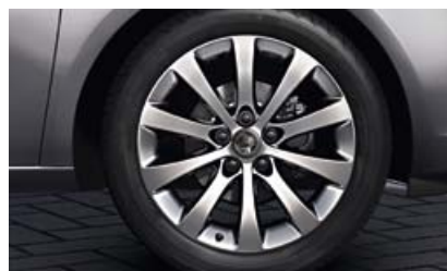
17-inch 10-spoke alloy wheels with 225/45 R 17 tyres.