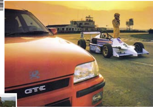
1984 – The MkII Astra introduced class-leading aerodynamic styling that still looks good today. The Formula Vauxhall Lotus ran a modified version of the Astra GTE's 2.0i 16v engine.