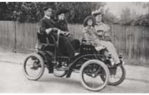
1903 – Forward thinking has been in our nature from the very start. The 6HP, our first ever car, had two forward gears. And no reverse.