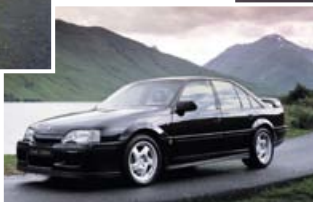
1989 – The Lotus Carlton was the world's fastest production four-door saloon.