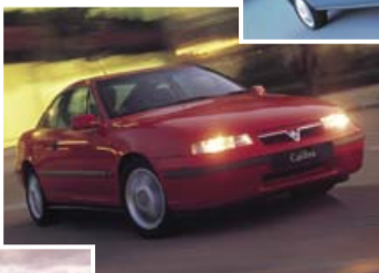
1990 – The Calibra was the world's most aerodynamic production car.