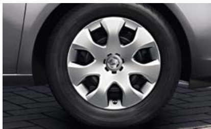
15-inch steel wheels with flush covers and 195/65 R 15 tyres.