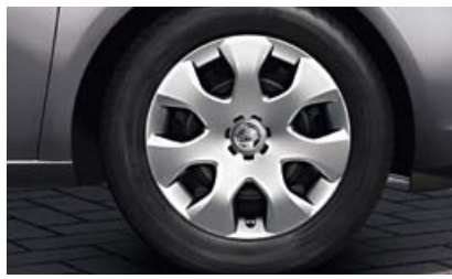
16-inch steel wheels with flush covers and 205/55 R 16 tyres.