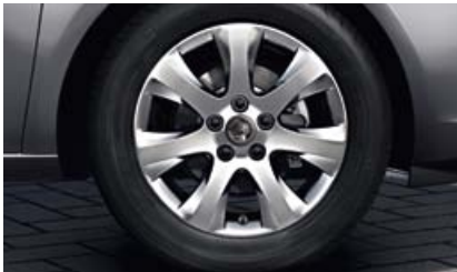
16-inch 7-spoke alloy wheels with 205/55 R 16 tyres.

*Excludes 1.6CDTi 16v/1.7CDTi 16v models.