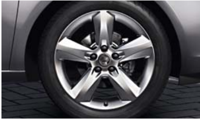
17-inch 5-spoke alloy wheels with 225/45 R 17 tyres.