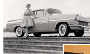
1957 – The PA Cresta introduced Americana styling to the UK.