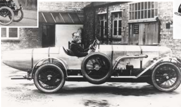
1922 – The Silver Arrow OE 30-98 was capable of speeds of over 100mph, this model was built for shipping magnate Sir Leonard Ropner to race at Brooklands.