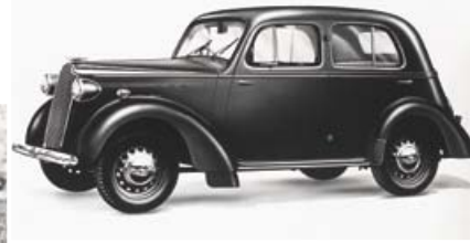
1937 – The Vauxhall 10' H-type, the first British car to have integral construction.