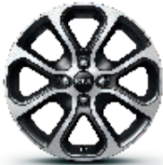
16" Alloys (195/45R16)