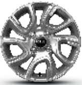
14" Alloys (175/65R14)