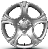
14" Steels with Cover (175/65R14)