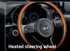
Heated steering wheel

Think a small car can't be big on space? Think again. The Picanto feels surprisingly spacious, with generous dimensions for head, shoulder and legroom – even in the rear. And with a heated steering wheel and front seats, there's even more reason to settle in and be comfortable.