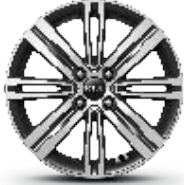
16" Alloys (195/45R16)