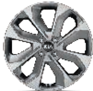
17" Alloy wheels (205/55R17)