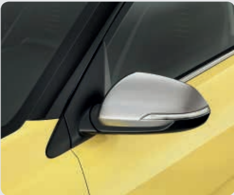
Door mirror caps, brushed When attention to detail is a must, these brushed stainless steel door mirror caps are the perfect expression of style and substance.