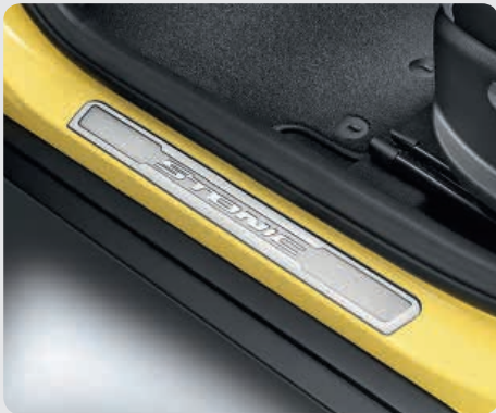
Entry guards First impressions always count and these stainless steel entry guards will give any passenger a flash of premium shine and a hint of the experience to come.