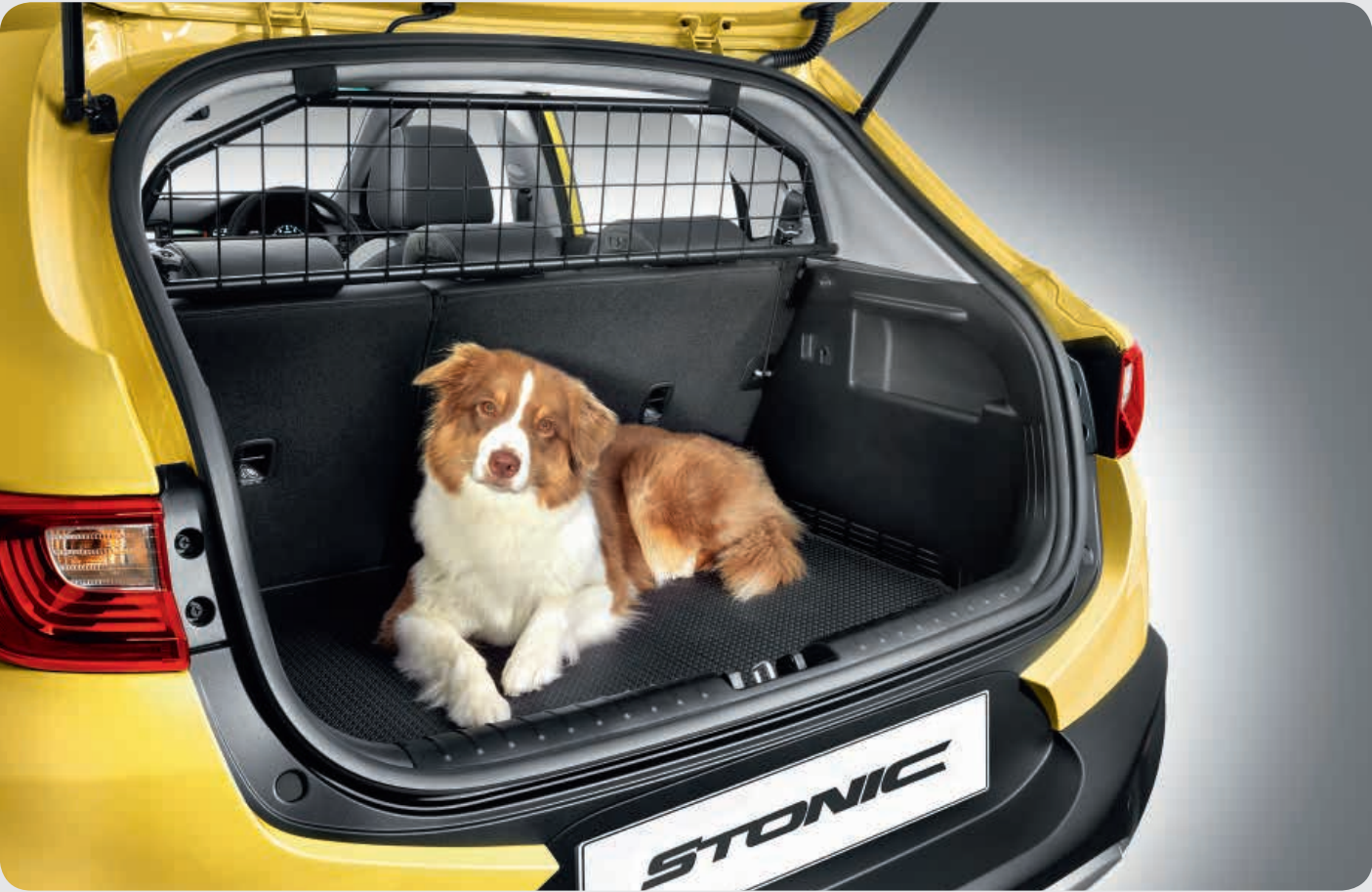
Dog guard Easier transport, higher comfort: for passengers and your pet dog. This robust grid is easy to install and perfectly fitting between the rear seatbacks and roof. It makes sure everything stays securely where it should, without restricting the driver's rear view.

True style is knowing your own mind and expressing your own personality. That's why the Kia Stonic comes with a range of custom-designed accessories from eye-catching side and tailgate trims to striking mirror caps and more. Here's just a small selection of the wide range you can choose from to make your Stonic uniquely yours.