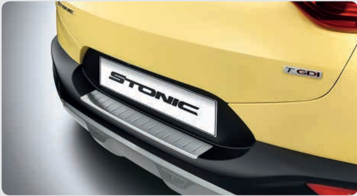
Rear bumper protector, brushed Just the right fit, just the right protection: whenever you load and unload heavy objects or luggage, this sturdy yet stylish stainless steel protector provides an effective shield against any paintwork damage to your rear bumper.