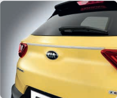
Tailgate trim line, brushed Made-to-measure, made-to-impress: add a polished edge to your tailgate with this trim line in brushed stainless steel.