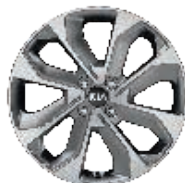
17" Alloy wheels (205/55R17)