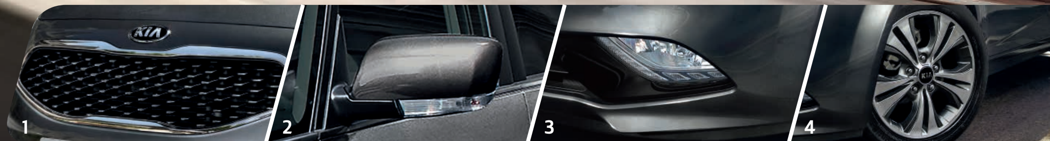
1. Signature 'tiger-nose' grille. 2. Electrically folding, adjustable and heated door mirrors with integrated indicator lights. 3. Front Fog Lights (Grade dependent). 4. Stylish alloy wheels.

Take a look around the Venga and you'll find plenty of eye-catching design features including the imposing 'Tiger-Nose' black high gloss grille with chrome surround, stylish alloy wheels, the convenience of electrically folding, adjustable and heated door mirrors with integrated indicator lights and stylish privacy glass (Grade dependent) which further enhances the exterior appeal of these models.