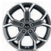
18" Alloy Wheels 235/45R18