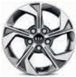
16" Alloy Wheels 205/60R16