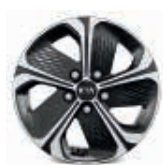
16" Alloy Wheels 205/60R16