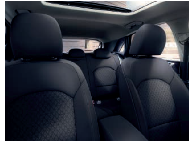
Black 'Premium' Cloth Seat Trim