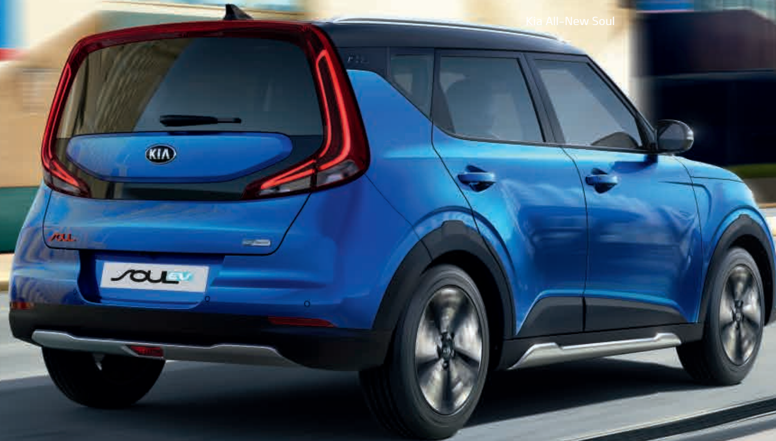
Kia All-New Soul

The All-New Soul EV celebrates its personality from every angle! From behind, the iconic 3D muscular rear design showcases futuristic-looking wrap-around LED rear lamps, surrounding the vertical tailgate for easy loading and extra boot capacity. Finished off with an iconic rear bumper shape and dynamic extra moulding for extra stability, the All-New Soul EV leaves a fun and lasting impression that others can only dream of.