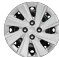
15-inch Steel Wheel