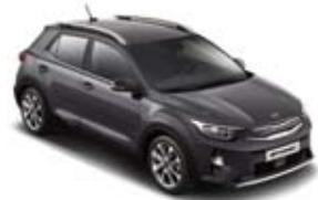
Platinum graphite _ ABT