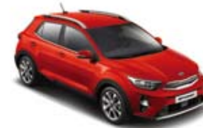
Signal red _ BEG