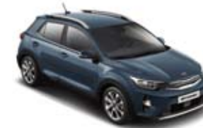
Smoke blue _ EU3