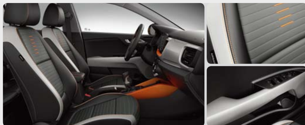
Gray Two-tone interior (Orange Package)

Two-tone light and medium gray artificial leather seats have bright orange stitching. Breathable gray cloth inserts include a nailhead pattern, horizontal embroidered stripes, and orange embossed accents that match the tone of the bright orange trim on the dash and center console. Door armrests are a lighter gray.