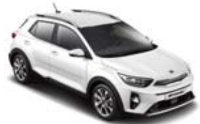
Clear white _ UD