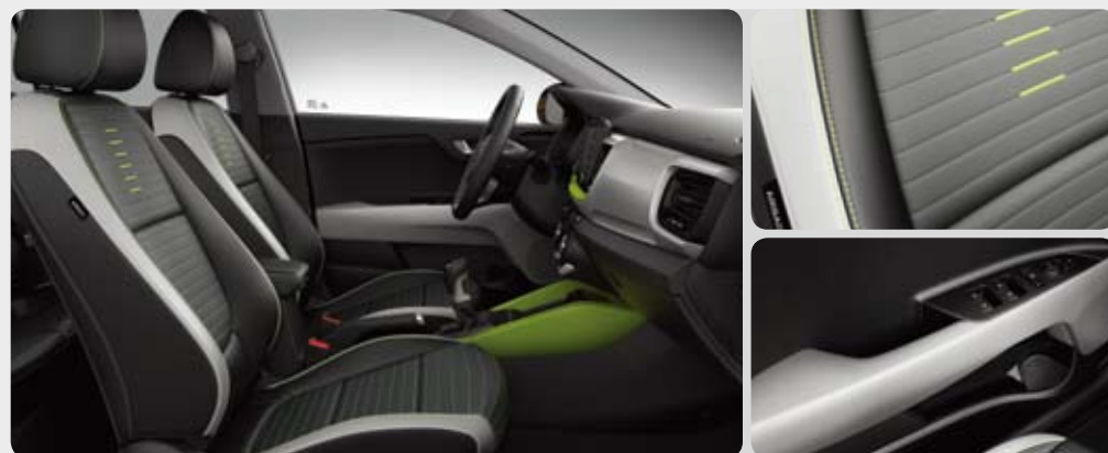
Gray Two-tone interior (Green Package)

Two-tone light and medium gray artificial leather seats feature bright green stitching. Breathable gray cloth inserts include a nailhead pattern, horizontal embroidered stripes, and green embossed accents that match the tone of the bright green trim on the dash and center console. Door armrests are a lighter gray.