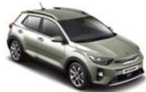
Urban green _ URG