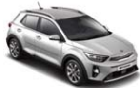
Silky silver _ 4SS