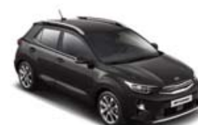
Aurora black pearl _ ABP