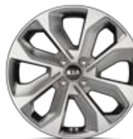
17-inch Alloy Wheel