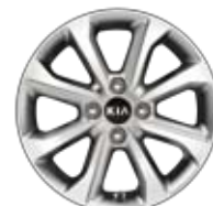
15-inch Alloy Wheel