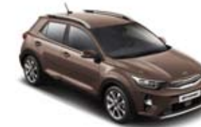
Deep sienna brown _ SEN