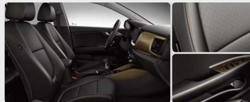
Black One-tone interior (Bronze Package)

Saturn Black artificial leather seats are stitched with bronze-colored thread, matching the tone of the bronze-colored door, dash and center console trim.