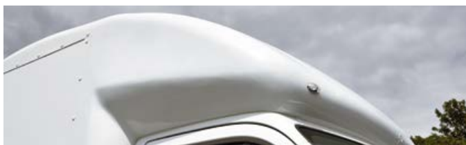
Aerodynamic canopy aids fuel economy.