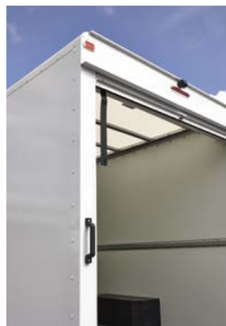
Rear access grab handle.