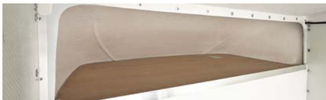
Useful over-cab storage facility.