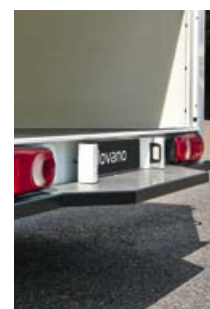
Low rear step height – 400mm.