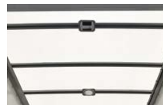
Opaque glass-fibre roof panel with load area light.