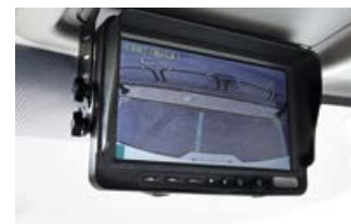
Optional rear-view camera.