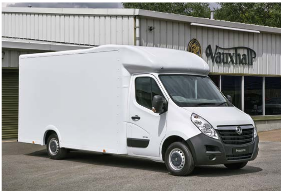
L3 H1 Maxi-Low Luton Van.

In addition to the standard Luton Van, Maxi-Low will also offer a walk-through multi-drop variant designed for parcel delivery and a larger Jumbo Luton Van with capacity of 26.0cu.m (918cu.ft).