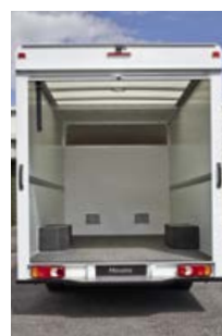
Roller shutter rear door.