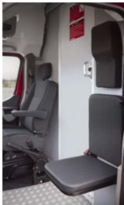
Folding passenger 'Jump' seat is standard.