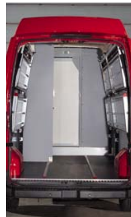
Larger loads can be accommodated when the shelving is folded up.