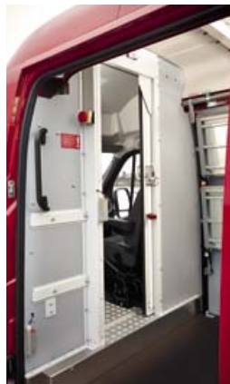
Access to the load area from the cab is through a sliding door.