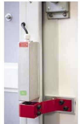
Automatic electro-mechanical locking system.