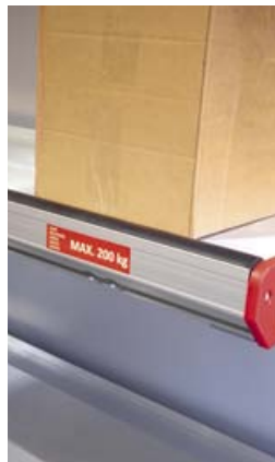
The shelves have an approved working load of up to 200kg.