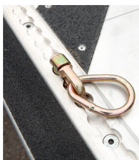
Adjustable tie rings.