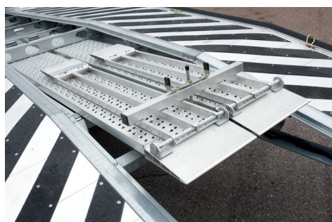
Lightweight aluminium loading ramps in stowed position.