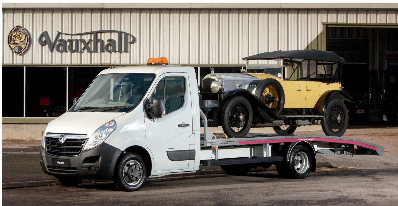
L4 H1 Chassis Cab featuring the Translite Car Transporter conversion.

Detail features include anti-slip material to the walkway and convenient ramp storage. A series of options are also available including a roof-mounted beacon bar, rear working lamps and Champion 9500 lb. (4309kg) power winch.