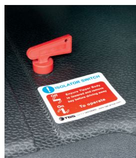
Isolator switch for improved safety.