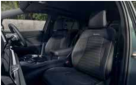
GT-line - Suede & Pressed Faux Leather Seat Upholstery