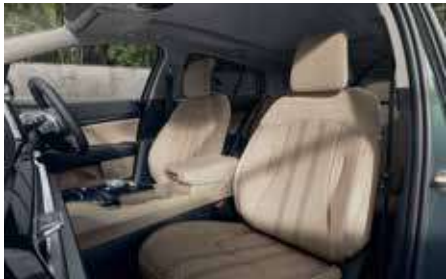
K4 - Ice Coffee Beige Leather Seat Upholstery