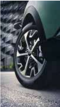
K3, K4 - 18" Alloys