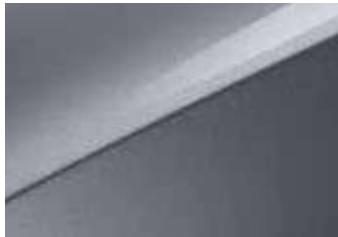
Lunar silver (CSS) (K3, K4, GT-line)