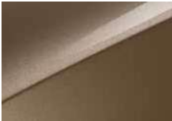
Machined bronze (M6Y) (K3)