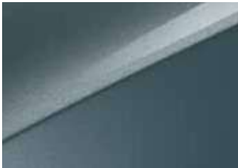
Yuka steel gray (USG) (K3, K4)