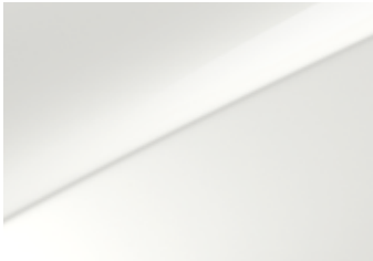
Casa white (WD) (K3)

Dynamic or distinctive. Sporty or subtle. Loud or luxurious. One-tone or two-tone. With many colours on offer, the choice is yours to enjoy. And don't forget the high gloss black roof.