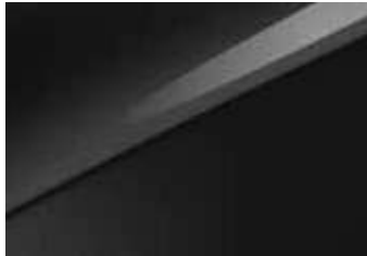
Pearl black (1K) (K3, K4, GT-line)