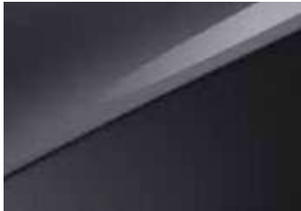
Penta metal (H8G) (K3, K4, GT-line)