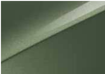
Experiment green (EXG) (K4)