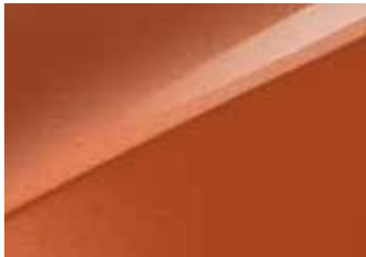
Orange fusion (RNG) (GT-line)