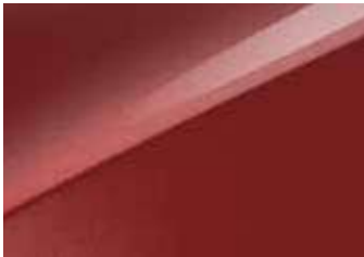
Infra red (AA9) (K3, K4, GT-line)