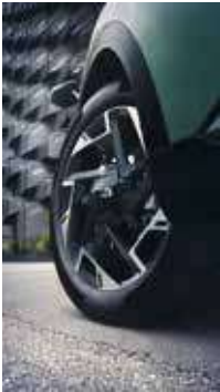
GT-line - 19" Alloy