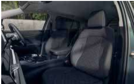
K3 - Black Saturn Cloth & Faux Leather Seat Upholstery