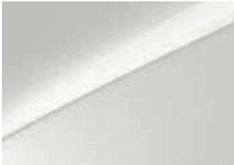
Deluxe white pearl (HW2) (K3, K4, GT-line)