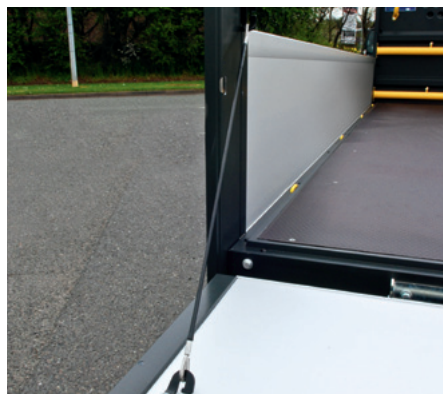
Wire ropes support the tailboard.