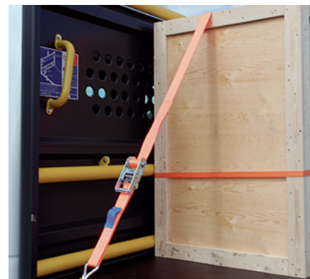
Three-level load rail lashing assembly for bulkhead.