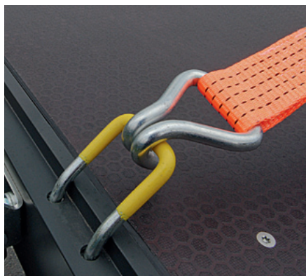
Recessed, wash down lashing eyes.