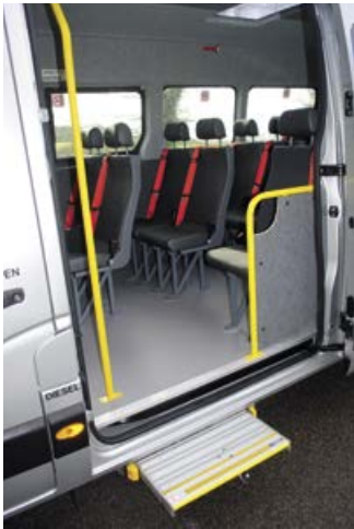
The wide-opening sliding side door and kick-out standard step ensure easy passenger access. LED lights are fitted to all entrances and exits.