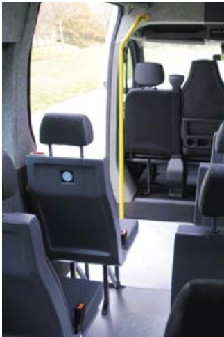
Lightweight composite lined interior with heavy duty non-slip flooring.