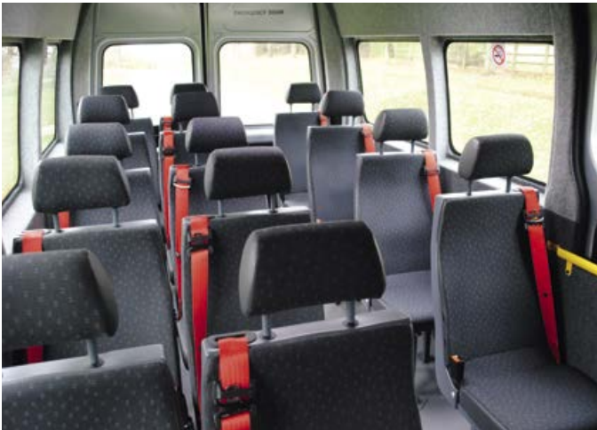
The fully trimmed interior and the two opening side windows have been designed for passenger comfort. Additionally all the rear seats are fitted with full head restraints with adjustable lap and diagonal high-visibility seatbelts.