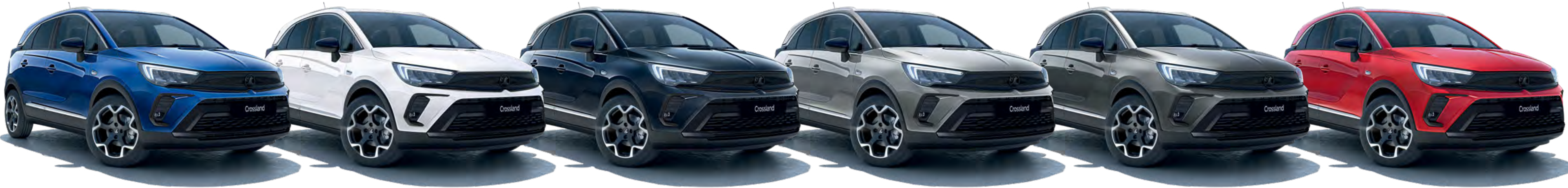
Navy Blue Two-coat metallic*