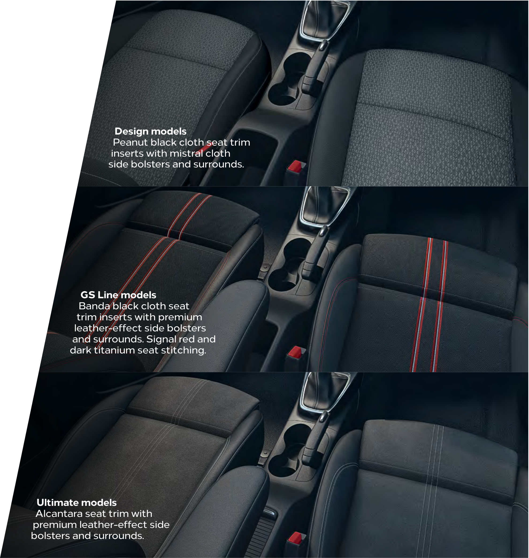
Design models Peanut black cloth seat trim inserts with mistral cloth side bolsters and surrounds.